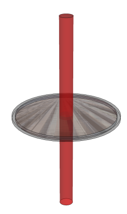
FIG. 1: A ring on the xy-plane in which a charged particle moving. The inter (outer) radius of the ring is \rho_a ( \rho_b ). There is an uniform magnetic field B at the center region of the ring up to radius \rho_0 < \rho_a

The above sane and peaceful statement is challenged by Aharonov and Bohm in 1959 [4]. Now suppose that a charged particle moving in a ring on the xy-plane as shown in Fig 1. This not-simply-connected topology of the ring would turn out to be critical. Here the inter (outer) radius of the ring is \rho_a ( \rho_b ). It is assumed that there is an